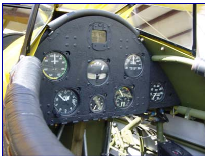
Rear Cockpit Panel