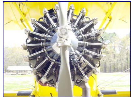
Lycoming R-680 300hp with 2B20