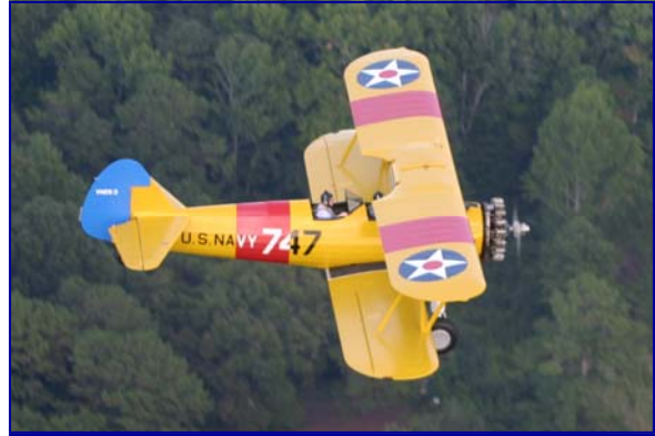
In The Air—it Does fly...