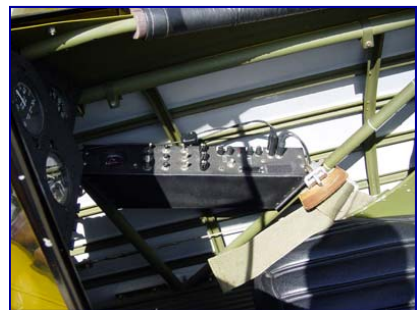
Rear Cockpit—Right Side View